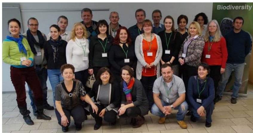
ELENA kick-off meeting: participants from four nations consult on the beginning of ELENA

The European idea has apparently suffered during the financial crises, ELENA shows that Europe is alive and continues to converge: Scientists, practitioners and teachers of educational institutions from Germany, Hungary, Romania and Georgia are working hand in hand in the trans-European cooperative project, funded by the European Union within the program of Lifelong Learning/Comenius.