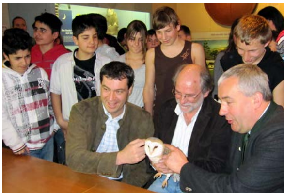
2010: Together with the students, Dr. Markus Söder (at the time Minister of State for Environment and Health) and Dr. Ludwig Spänle (at the time Minister of state for Education and Culture) are enthusiastic to “Tiere live”

Whether amphibians, snails, butterflies, hedgehogs or recently also chickens, students should experience enthusiasm in direct contact with living animals, but also overcome reservations and finally take responsibility of their protégés. Guided by the monitoring folder to “Tiere live” with 15 animal chapters and more than 70 individual actions described in detail - a comprehensive basis is available for teachers for the concrete implementation. The project “Tiere live” was a central contribution of Bavaria to the year of biodiversity in 2010 and was promoted together by the former Bavarian State Ministry for Environment and Health and by the Bavarian State Ministry of Education and Culture.